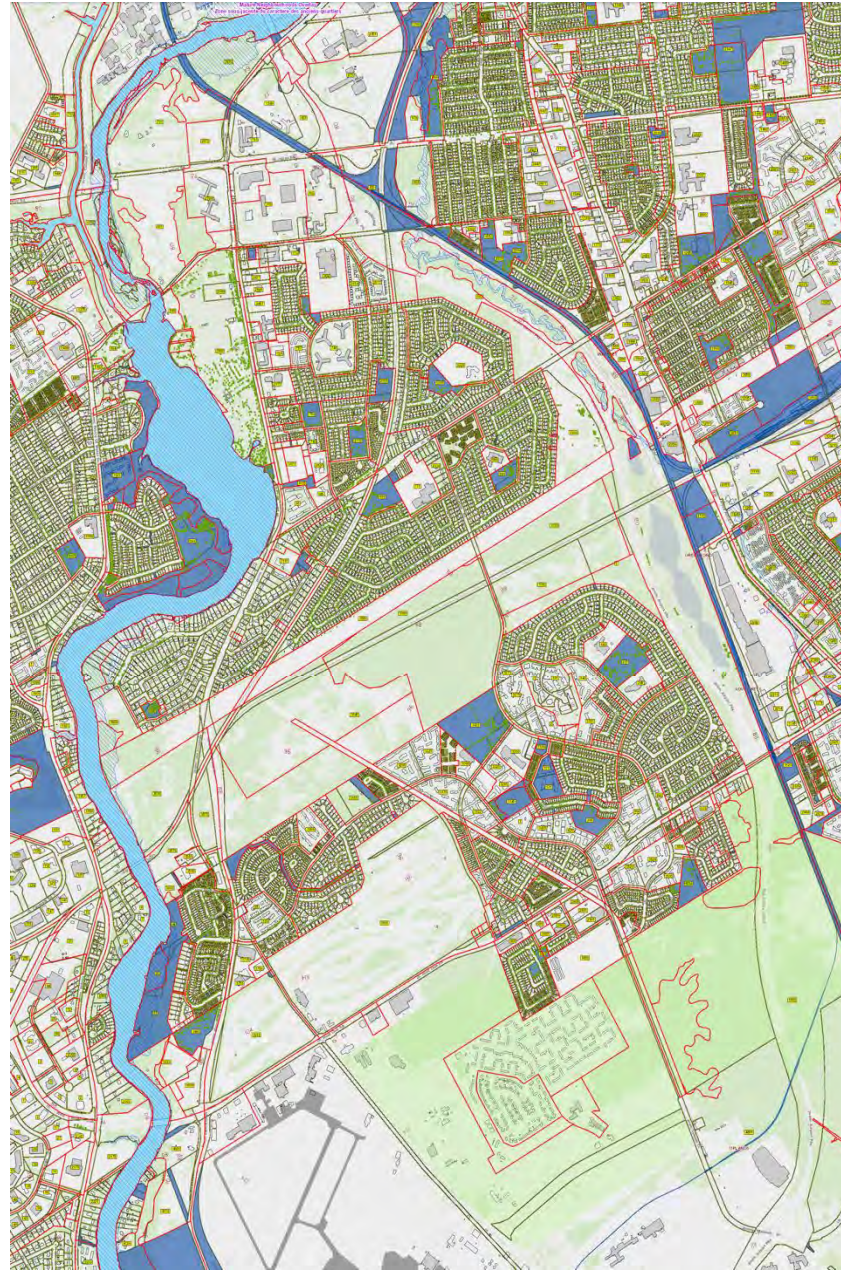
Property Level Plan