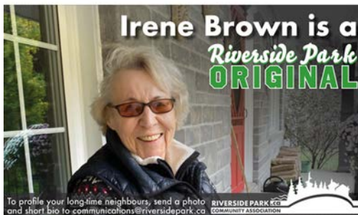
To profile your long-time neighbours, send a photo and short bio to communications@riversidepark.ca