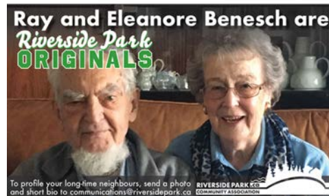
To profile your long-time neighbours, send a photo and short bio to communications@riversidepark.ca